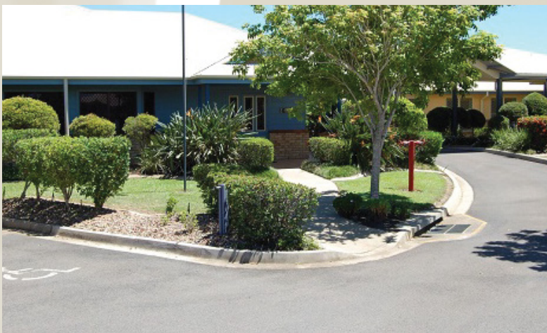
Churches of Christ Hervey Bay

"We are privately owned and very flexible to our clients needs"