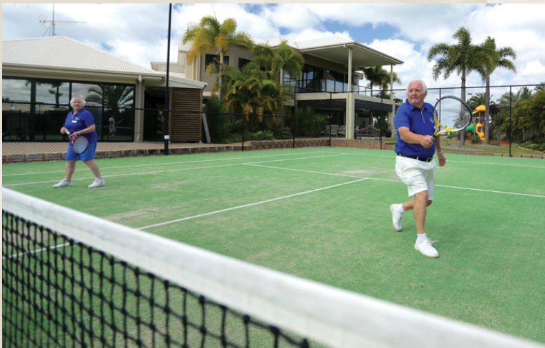
Palm Lakes Bundaberg

"We worked on our first aged care project in 1993"