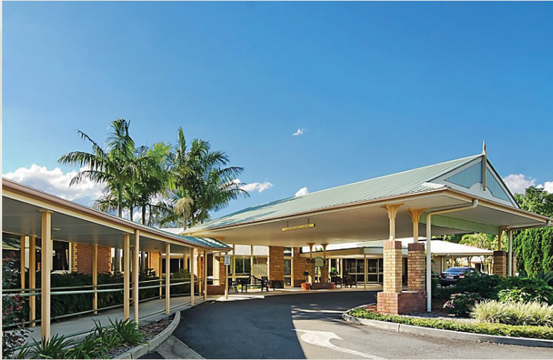
Milford Grange RSL Care

"We worked on our first aged care project in 1993"