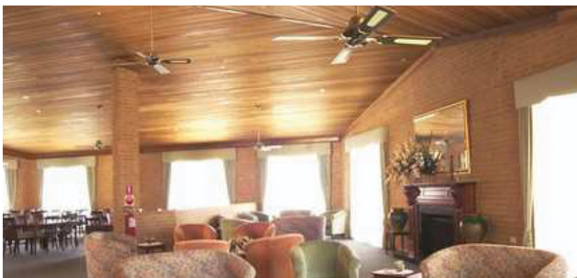
Viamera Retirement Village, Sydney